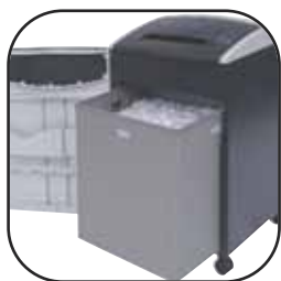
Easy to empty pull-out bin and internal storage area