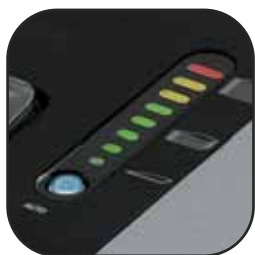
Usage indicators showing shredder capacity

Automatically oils the shredder to maintain the highest performance