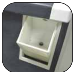
Easy and clean auto-oil mechanism