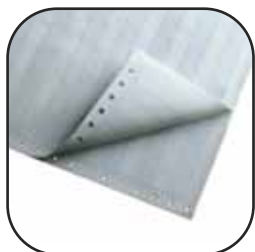
Wide throat permits the shredding of A3 size & continuous computer paper